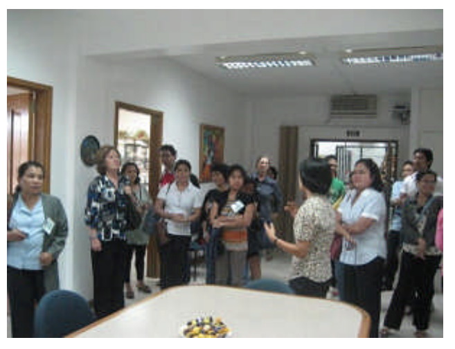
Tour at Adventist International Asian School Library