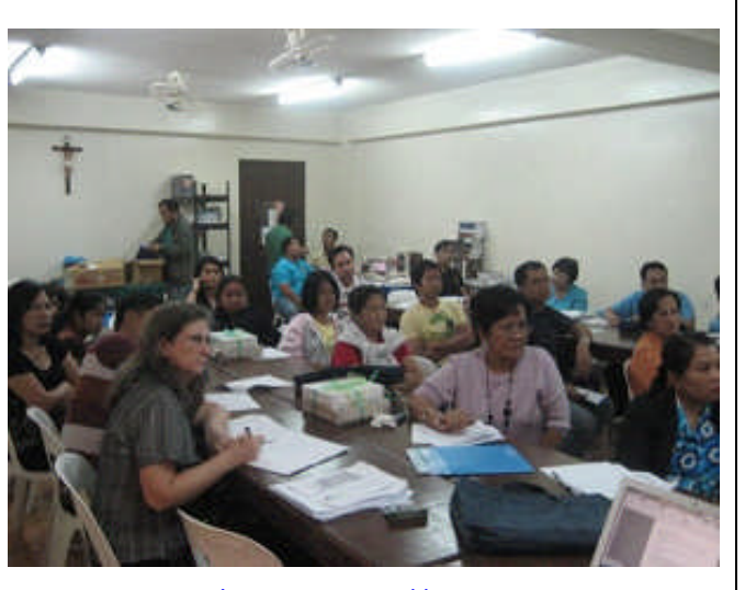
Wow! Very attentive librarians

Congratulations to PTLA. For ATL wishes you a good luck for your future endeavours.